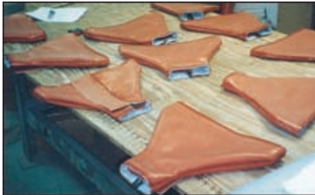
Furnace Sealing Bags prior to installation

PT&P's furnace seal bag works similar to a fabric expansion joint. The bag, consists of multiple layers of flexible, flame and heat resistant, impervious fabric designed to operate from start up to high temperature design conditions. The bag contracts and expands with varying furnace temperatures. The seal bag allows thermal expansion and prevents the loss of heat through the furnace floor which conserves energy and reduces the cost of energy.