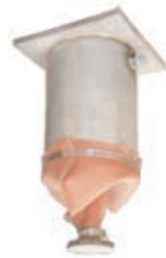
Furnace Sealing Bag after movement & temperature tests